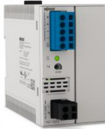
Power Supply 100-240VAC/48VDC 2A